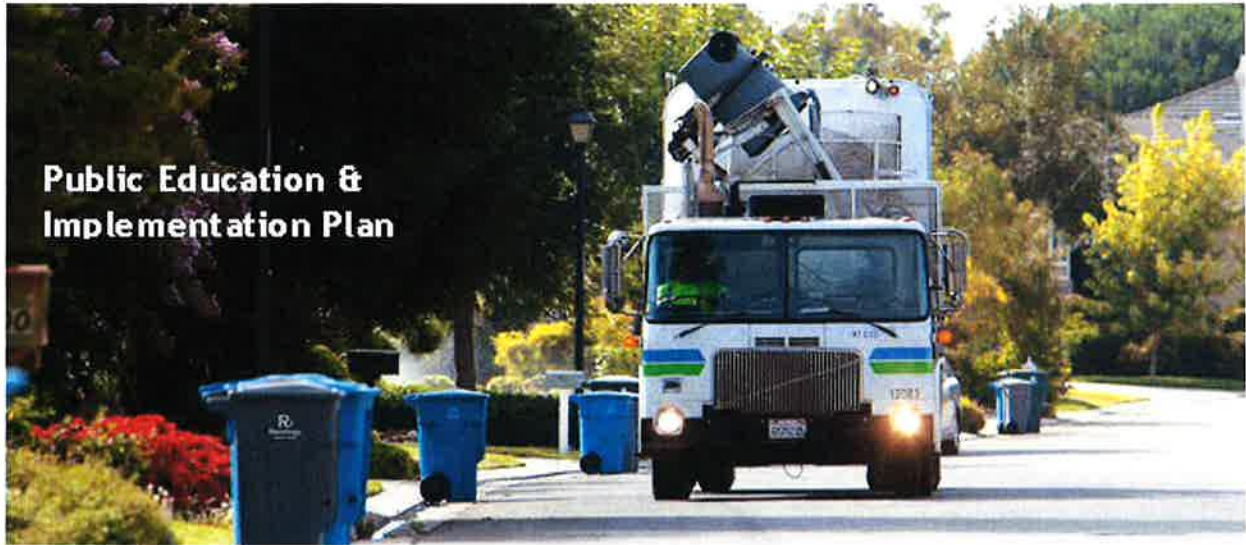
EXHIBIT C: PUBLIC EDUCATION PLAN