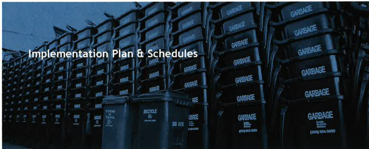
EXHIBIT C: PUBLIC EDUCATION PLAN