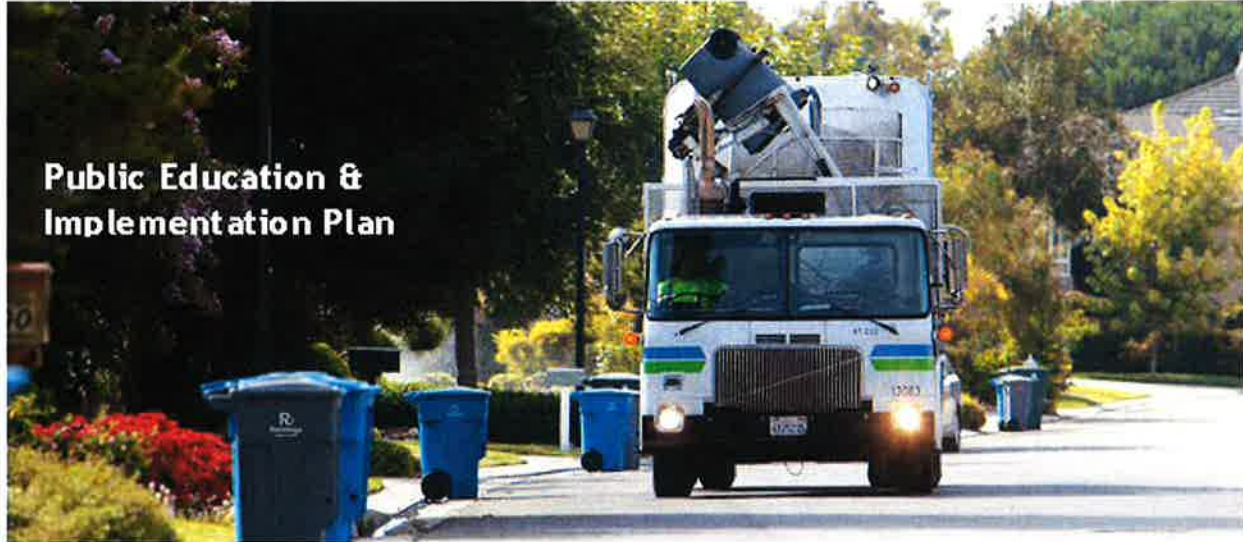
EXHIBIT C: PUBLIC EDUCATION PLAN